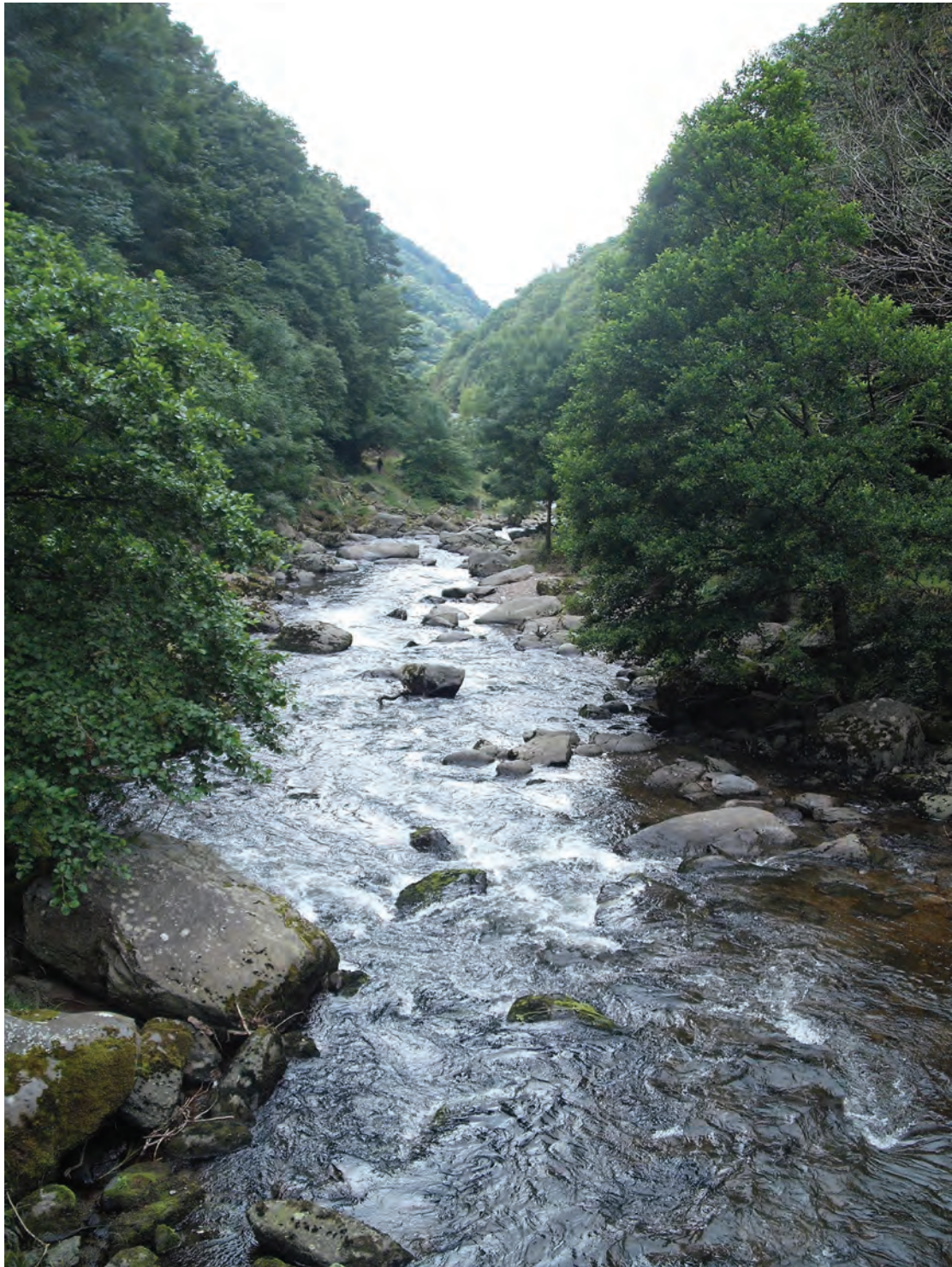
Fig. 1 The East Lyn River, Devon